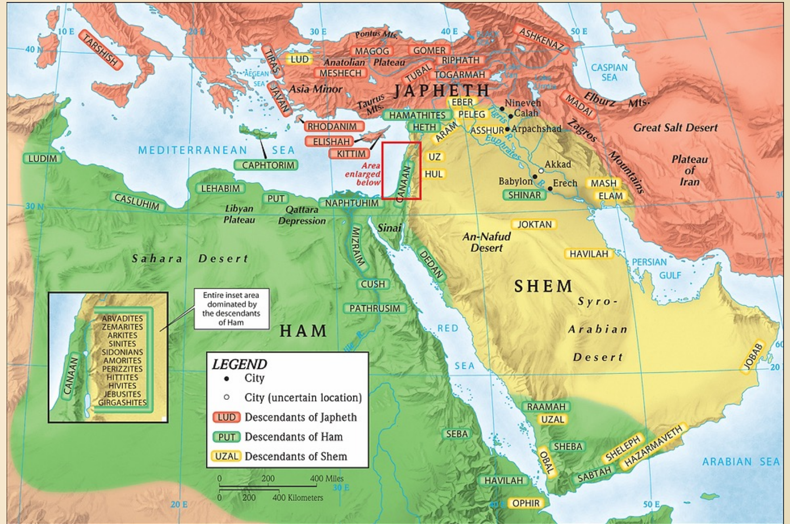
The World of Genesis 10