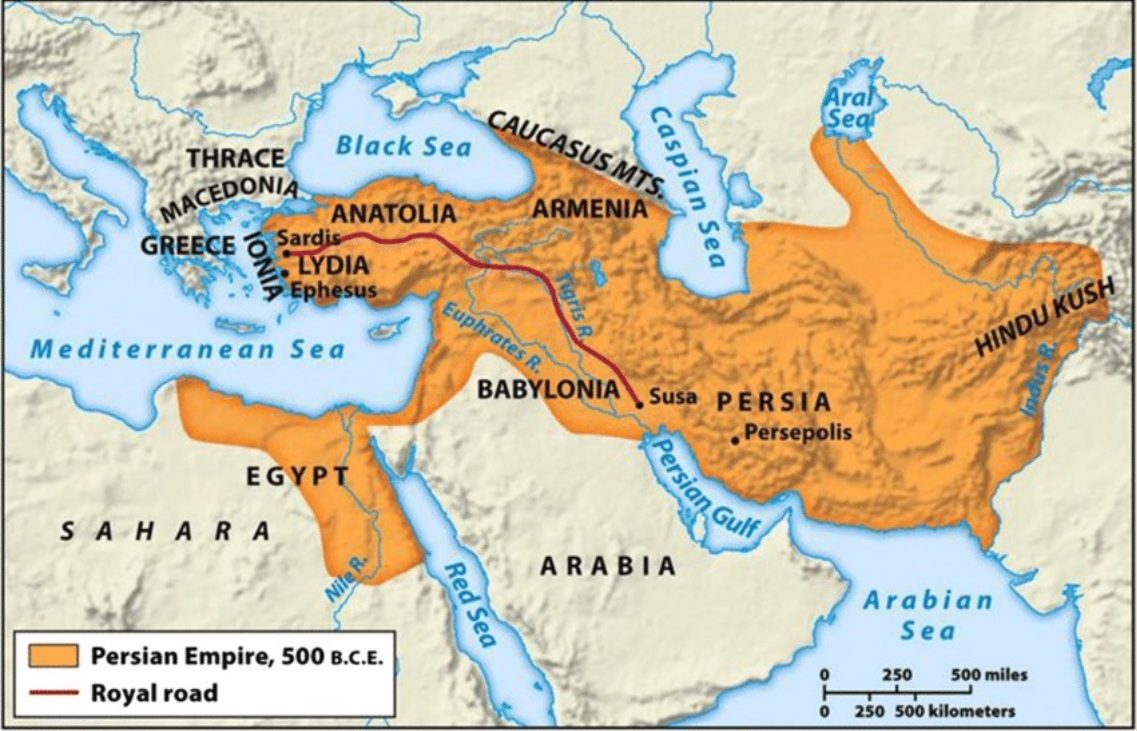
Map 4-1 Ways of the World, First Edition © 2009 Bedford/St.Martin's

Note the placement of Susa, about 150-200 miles East of Babylon