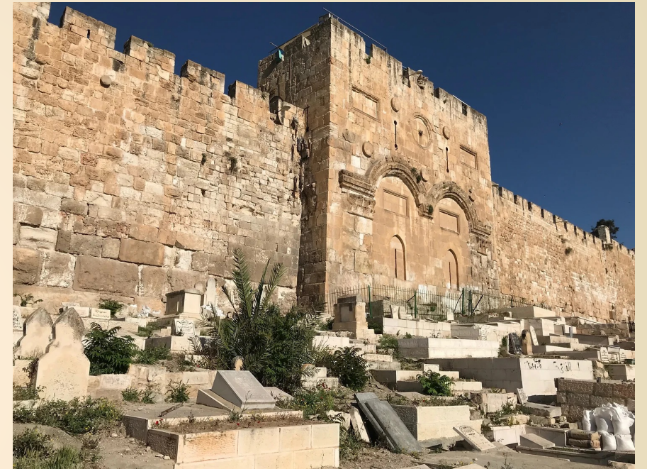
GOLDEN GATE, SHUSHAN GATE, EASTERN GATE TODAY AKA MERCY GATE