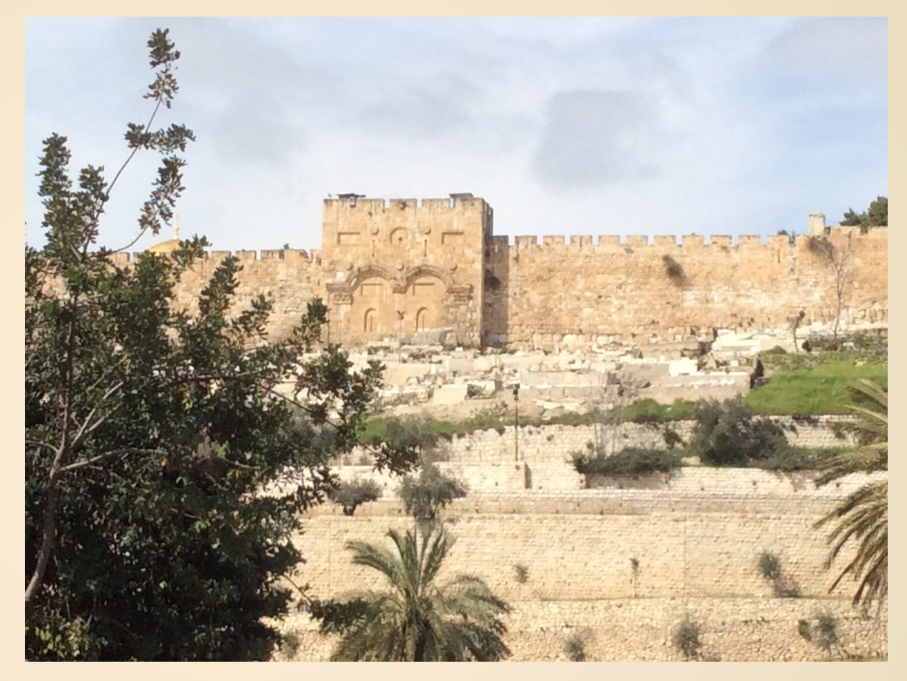
Closer View of the Southern or Golden Gate

View from Mount of Olives to Temple Mount