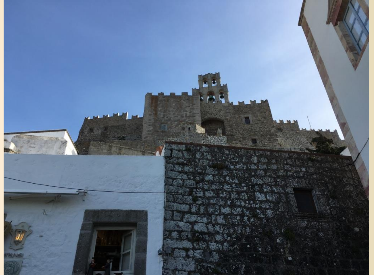
Entrance to the Cave